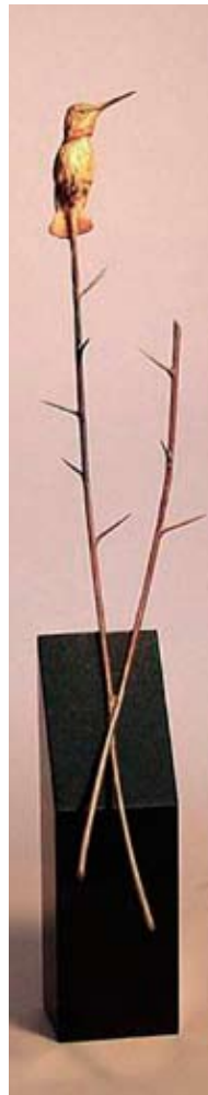
Garden Warrior Stephan Savides Bronze Dimensions: 21" x 4" x 9"

Reception and Awards: Saturday, May 2, 2009 from 7-9pm